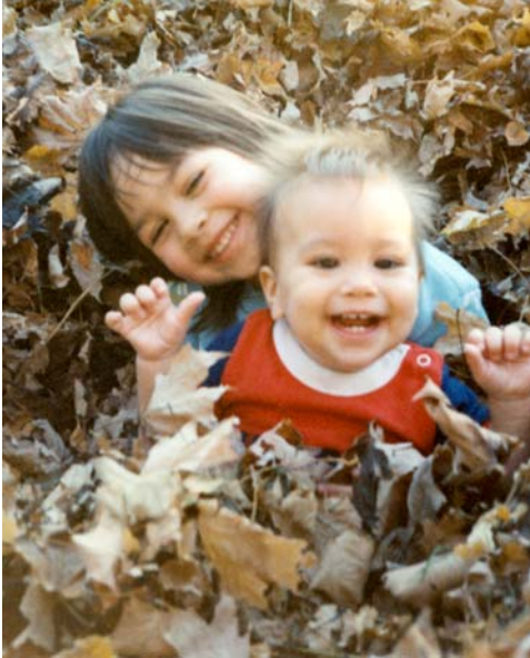
Guess whose friends we are!