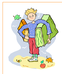
Big Book Sale begins November 2 nd .

The sale will be held in the lower level Bookstore at 128 N. County St., Waukegan, IL. Call (847) 623-2041 ext 257 for further information. Free parking available - call for details.