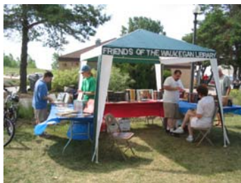
Friends at Waukegan HarborFest

The Friends is sponsoring a trip to two of Chicago's museums, the Mexican Fine Arts Museum and Chicago History Museum. This all-day bus tour leaves on Thursday, October 26 th and the $40.00 cost includes transportation and a box lunch. Join your friends for a stimulating day. Call (847) 623-2041, ext 257 for information.